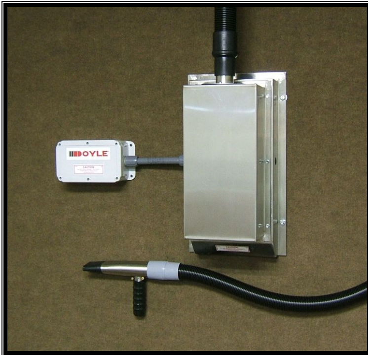
Rapid Dry blower assembly